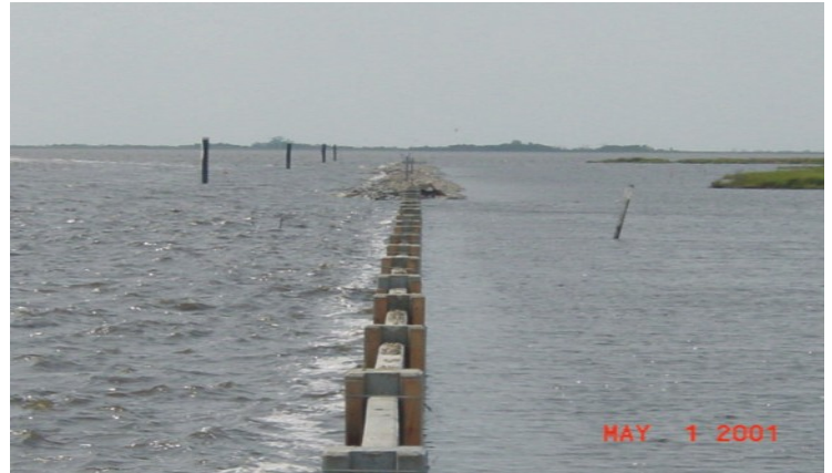
Rock dikes, lightweight core dikes, and concrete sheet pile structures were tested to determine constructability, stability, and applicability.