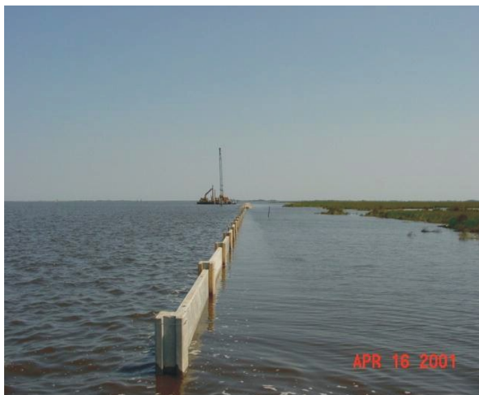
Concrete panel structures such as this one dramatically reduce the wave energy that can erode fragile shorelines.

Approximately 35,000 feet of shoreline protection will be implemented. Approximately 6,200 feet is a traditional foreshore rock dike. The remainder of the shoreline protection will consist of concrete panel structures.