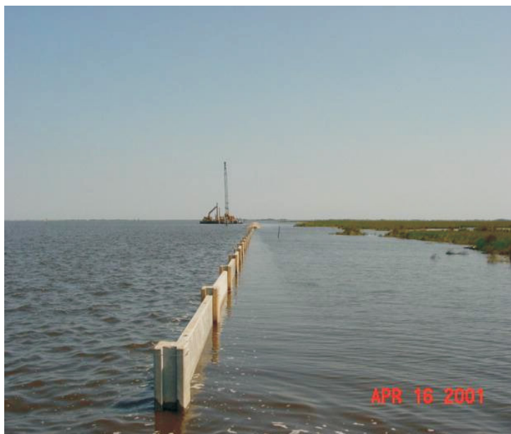
Concrete panel structures such as this one dramatically reduce the wave energy that can erode fragile shorelines.

Approximately 35,000 feet of shoreline protection will be implemented. Approximately 6,200 feet is a traditional foreshore rock dike. The remainder of the shoreline protection will consist of concrete panel structures.