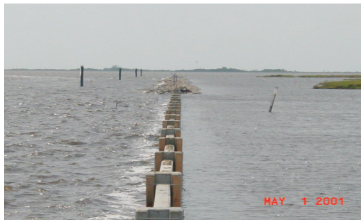
Rock dikes, lightweight core dikes, and concrete sheet pile structures were tested to determine constructability, stability, and applicability.