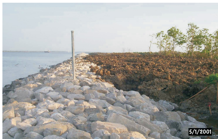
This completed rock riprap structure was placed adjacent to the existing shoreline to buffer it from the erosive forces of wake-induced wave energy.