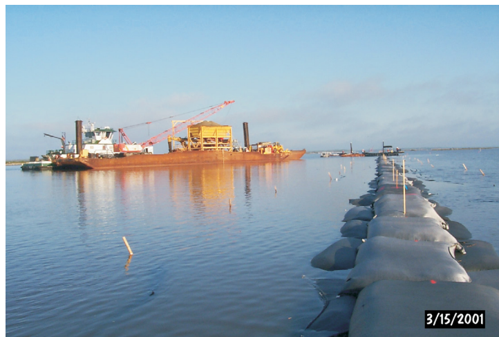
Geo-textile fabric bags were filled with a lightweight aggregate and then sewn closed. These bags act as the supporting core of the shoreline stabilization structure.

Construction was completed in June 2001. Baseline monitoring information has been collected and will be used to evaluate the project’s effectiveness. The O&M Plan was signed in October 2002. This project is on Priority Project List 6.