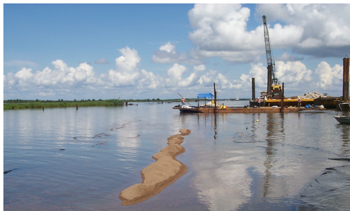
In order to prevent the heavy rock riprap from settling too deep in the organic soil, geo-textile cloth was first put down and used as a base.

This project was coordinated with the U.S. Army Corps of Engineers maintenance-dredging program to provide beneficial use of dredged material by placing it behind the armored levee in order to create new marsh. Construction was completed in November 2000. The O&M Plan was signed in July 2002. This project is on Priority Project List 4.