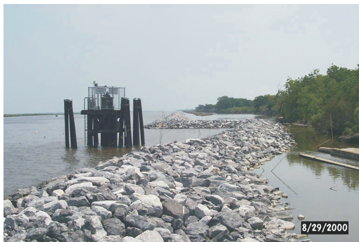
Where existing structures were encountered, such as the crossing of the freshwater delivery system to Grand Isle pictured above, the alignment of the structure was altered.

For more project information, please contact: