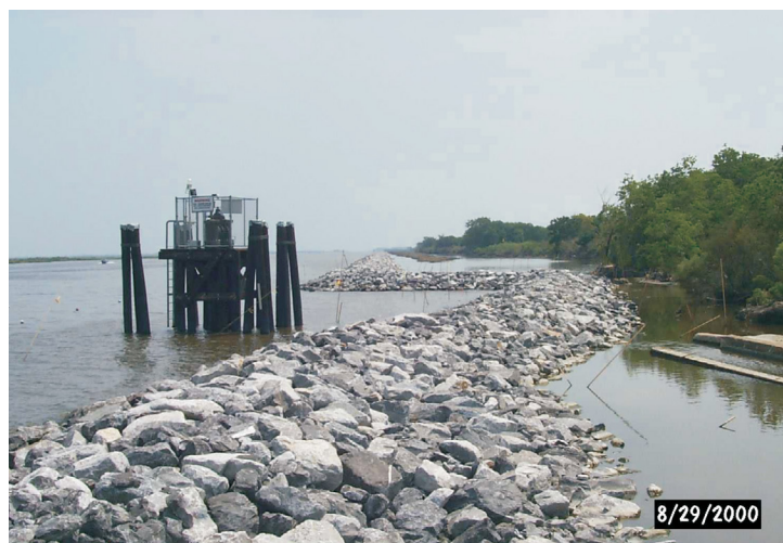
Where existing structures were encountered, such as the crossing of the freshwater delivery system to Grand Isle pictured above, the alignment of the structure was altered.