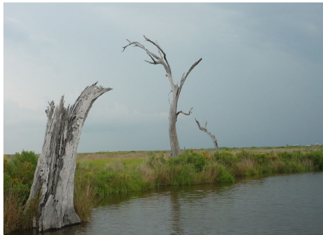
As subsidence and salt water intrusion take hold, the prominent ridge along Bayou Grand Chenier is converted to marsh.

Hydraulically dredged river sediments will be used to restore 10,625 linear feet of the Bayou Grande Cheniere Ridge. The ridge will have a 25-ft crown width, a target height of +4.5 ft NAVD88, and side slopes of 1(V):8(H). Herbaceous plantings