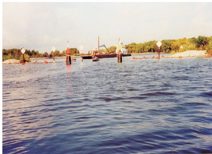
Weirs constructed with a boat bay aid in the effective management of hydrology while still allowing the passage of small boats and vessels.

The project features include two fixed crest rock weirs with boat bays, across Goose Bayou and Bayou Dupont. The purpose of the project is to manage the sediment-laden fresh water diverted by the Naomi Siphon [a state- and Plaquemines Parish-funded project (BA-03) located along the west bank of the Mississippi River near the community of Naomi]. The two fixed crest weirs will assist in the management of the siphon outfall water by reducing freshwater loss, allowing maximum sediment retention and nutrient uptake, and reducing saltwater intrusion into the project area.