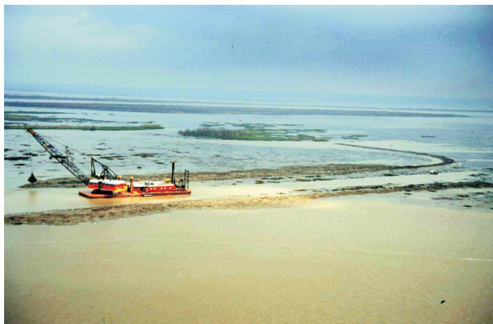
This restoration technique is an example of what is proposed in the Castille Pass.

The open crevasse channels are frequently short-lived because sediment accumulation within the channels decreases flow efficiency. Also, maintenance dredging, the placement of material dredged from the navigation channel has an effect on riverflow efficiency. As riverflow through a crevasse channel is reduced, the amount of sediment that can be deposited in the delta is likewise reduced, resulting in decreased marsh development.