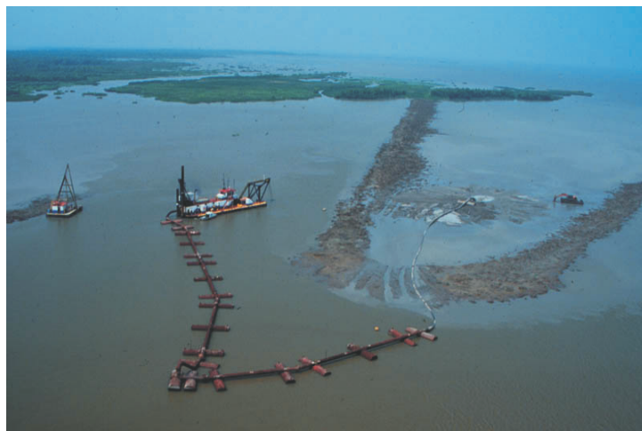
A hydraulic dredge pumps sediment to create new wetland habitat in the project area south of Morgan City.

The project was an opportunity to increase marsh habitat in the northwestern portion of the Atchafalaya Delta. In 1998, over 3.4 million cubic yards of sediment north of Big Island were dredged to create several distributary channels that reestablished water and sediment flows into shallow water areas in the delta. The sediment was strategically placed to mimic natural delta lobe formation at an elevation suitable for marsh growth. Over 922 acres of new habitat were directly created by construction, and the reestablished water and sediment flows are expected to add an additional 2,000 acres over the life of the project.