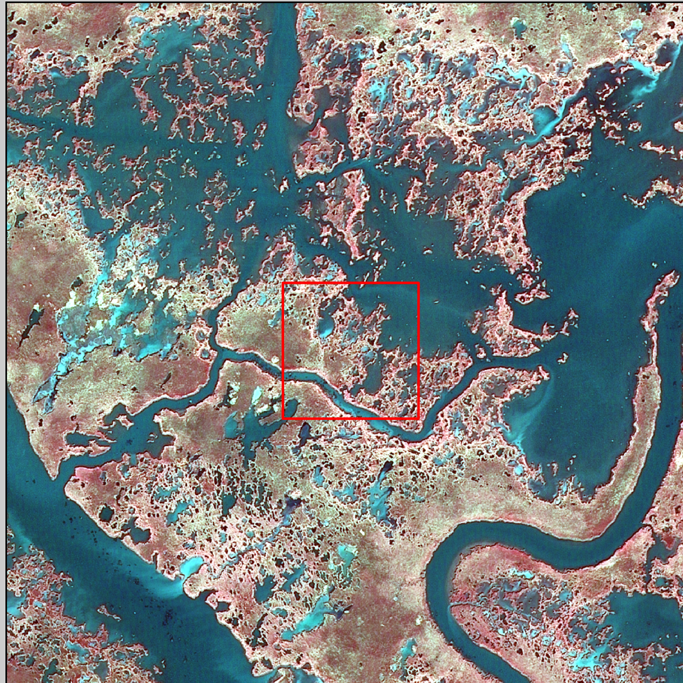
2008 Digital Image