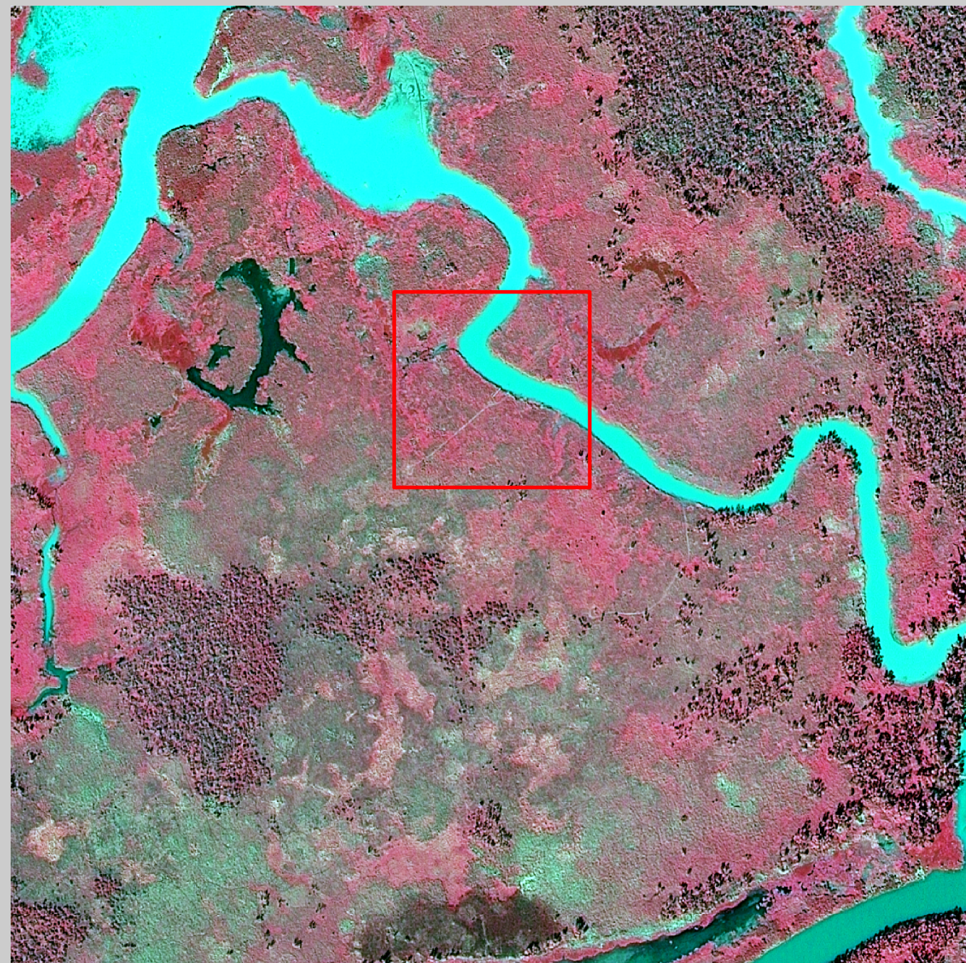
2008 Digital Image