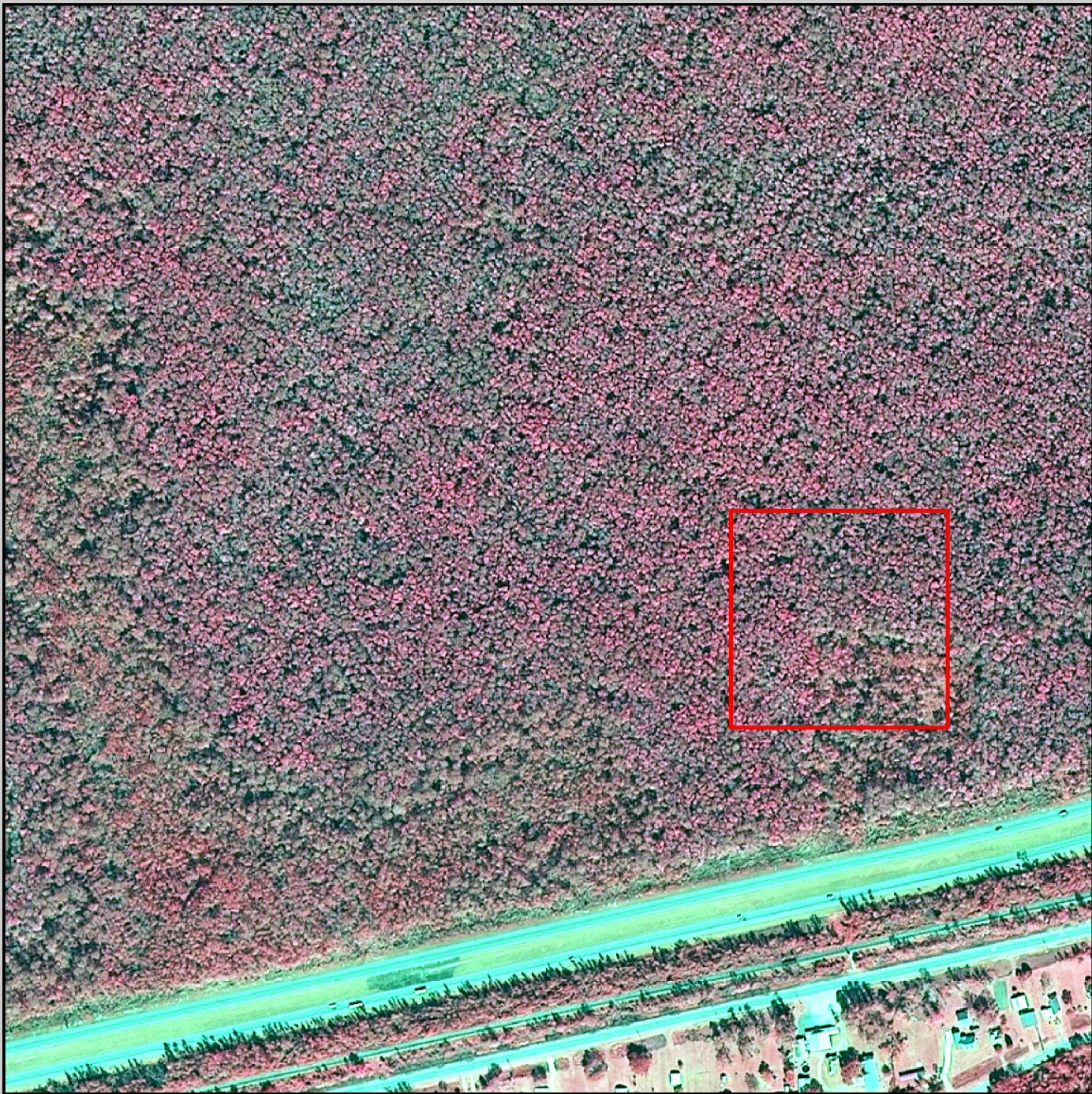
2008 Digital Image