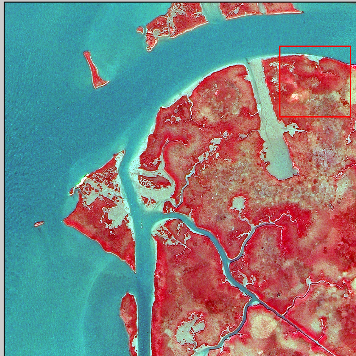
2008 Digital Image