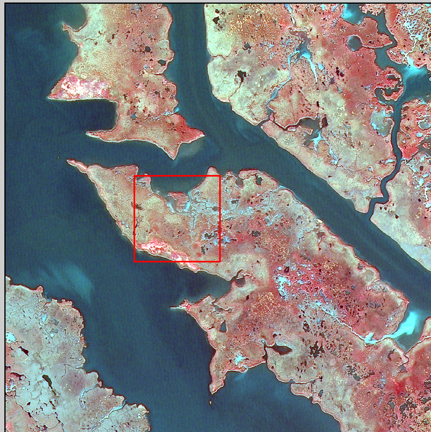
2008 Digital Image