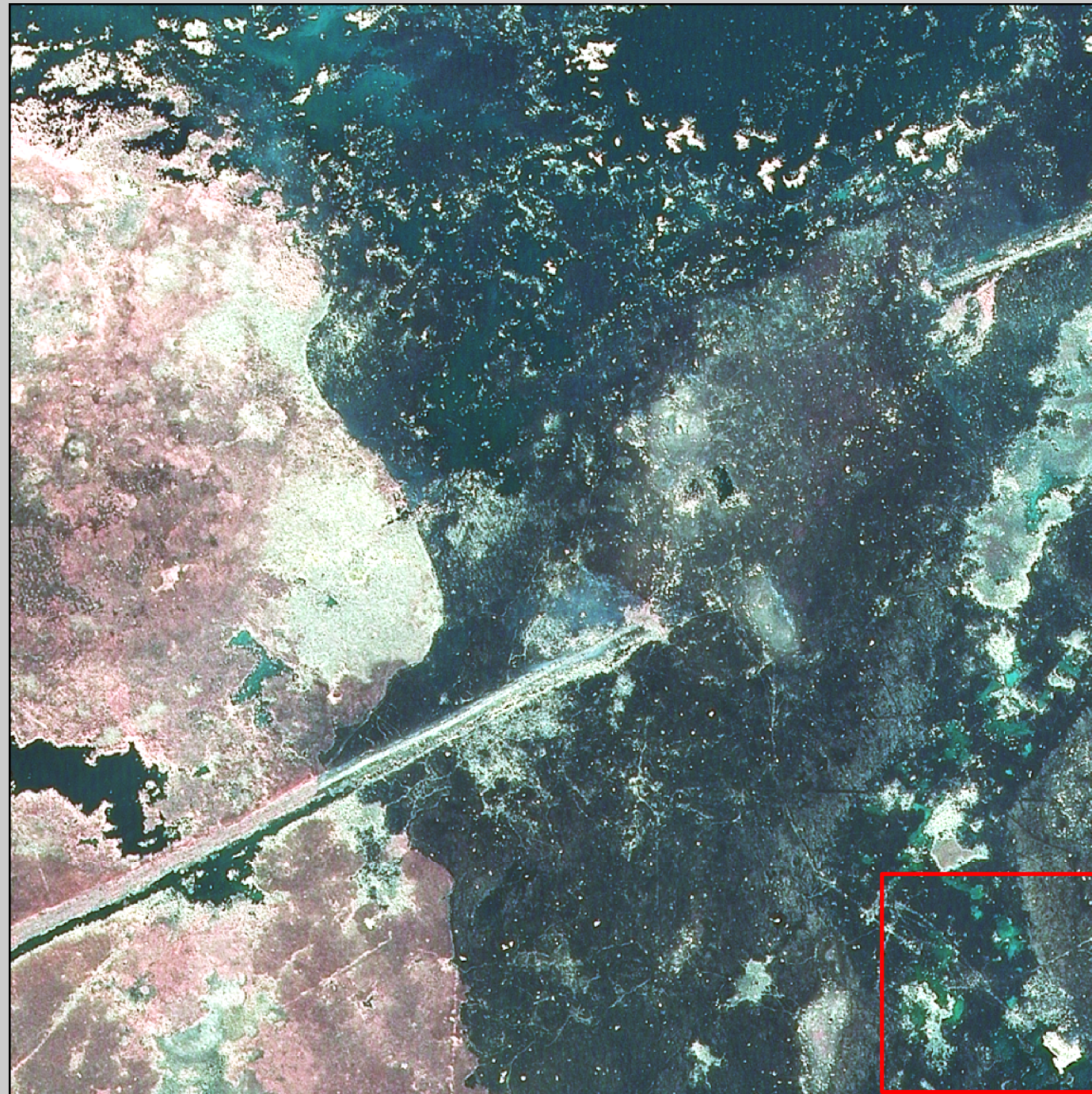
2008 Land-Water Classification