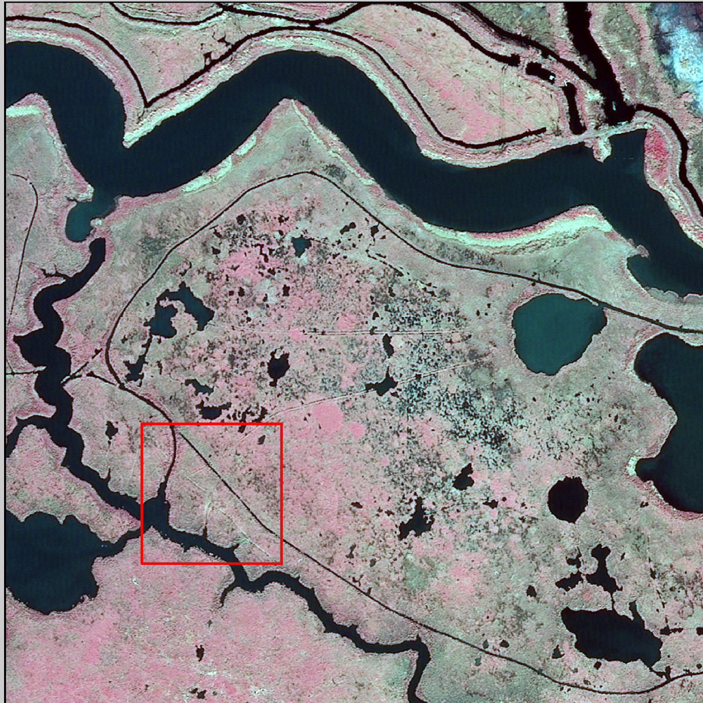
2008 Digital Image