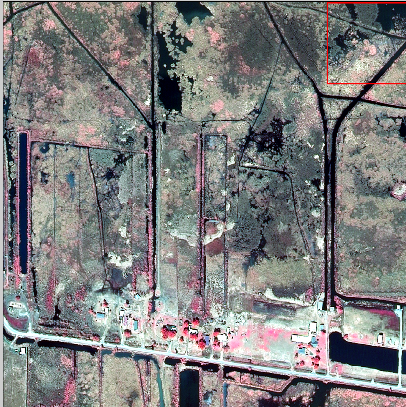
2008 Digital Image