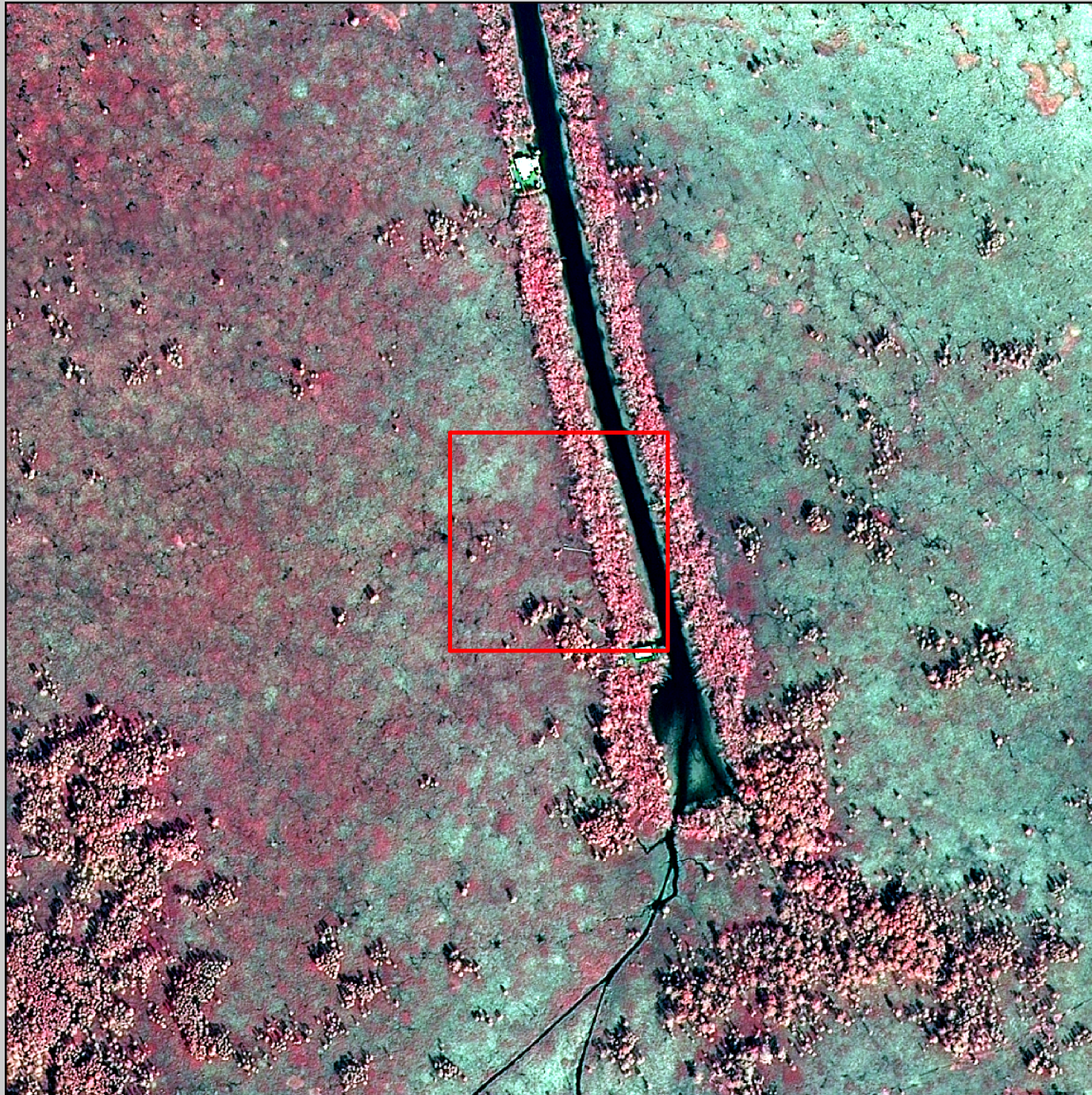
2008 Digital Image