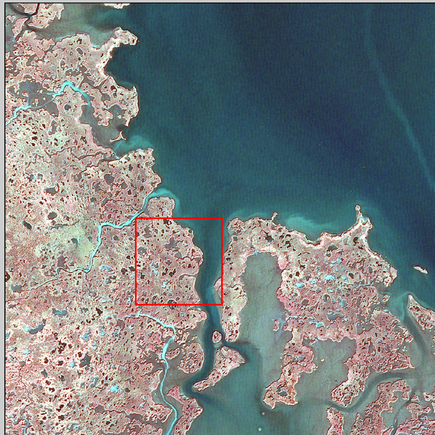
2008 Digital Image