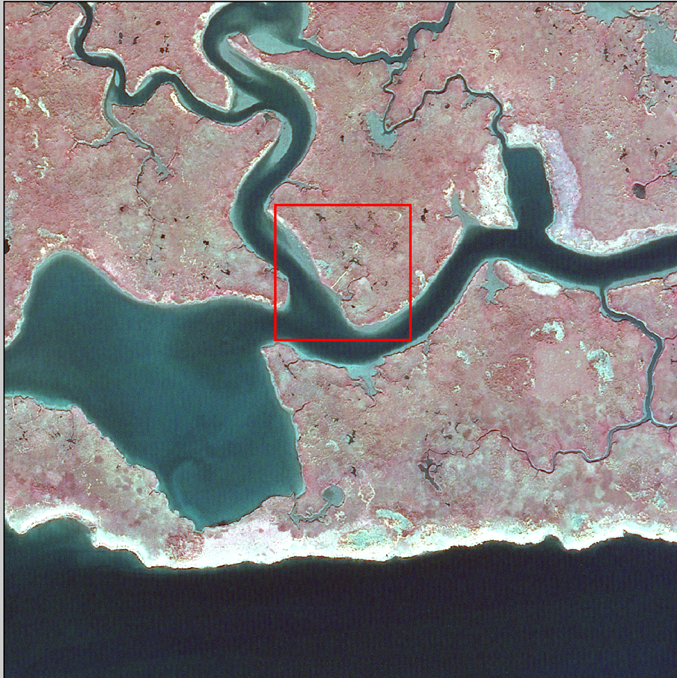
2008 Digital Image