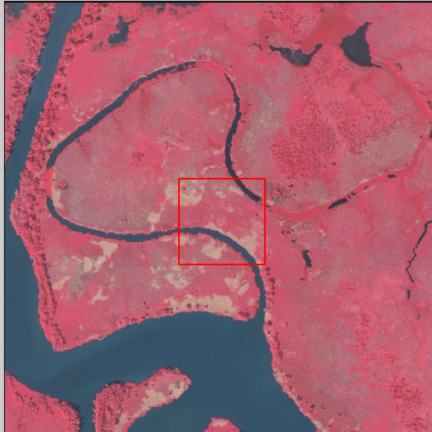
2005 Land-Water Classification