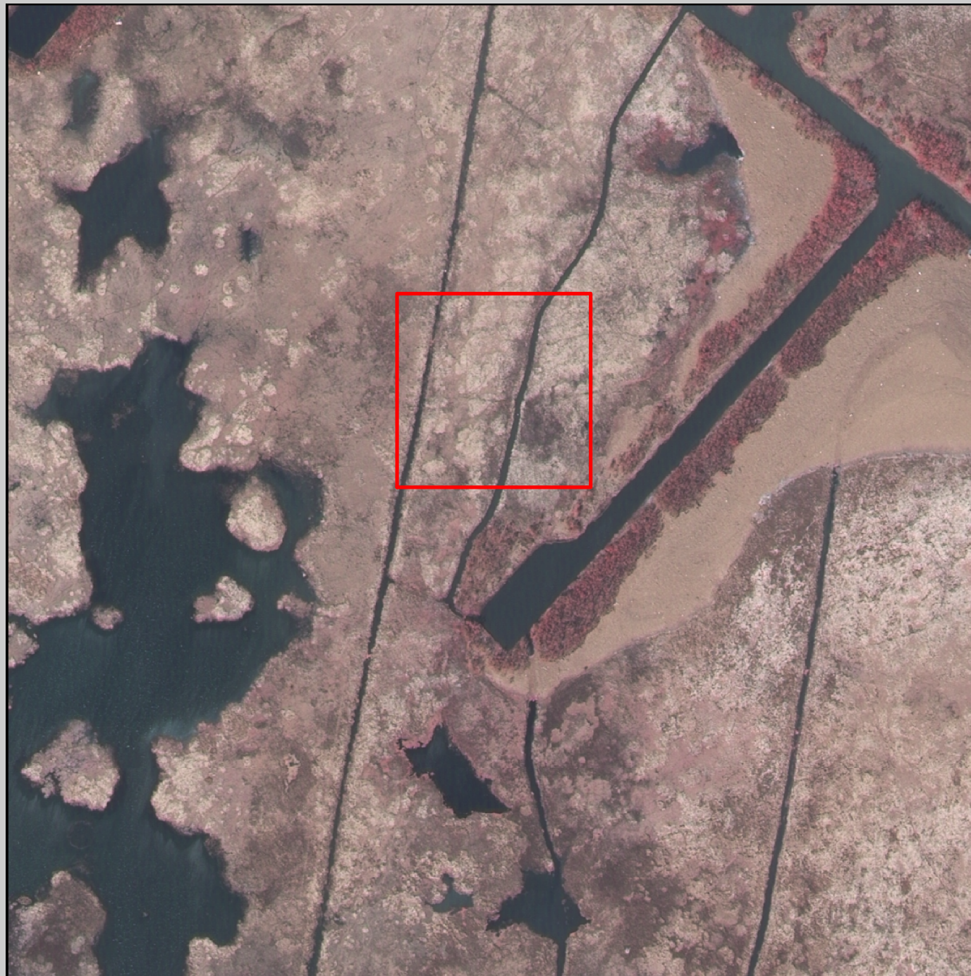
2005 Digital Image