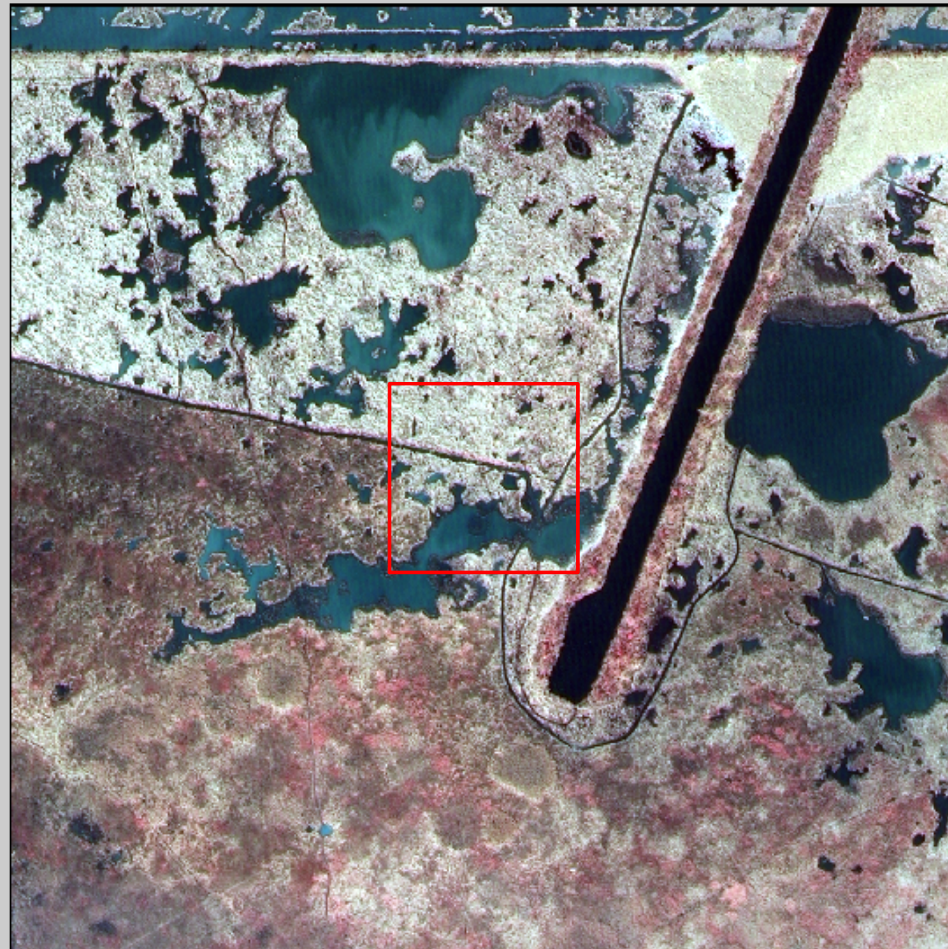
2005 Digital Image