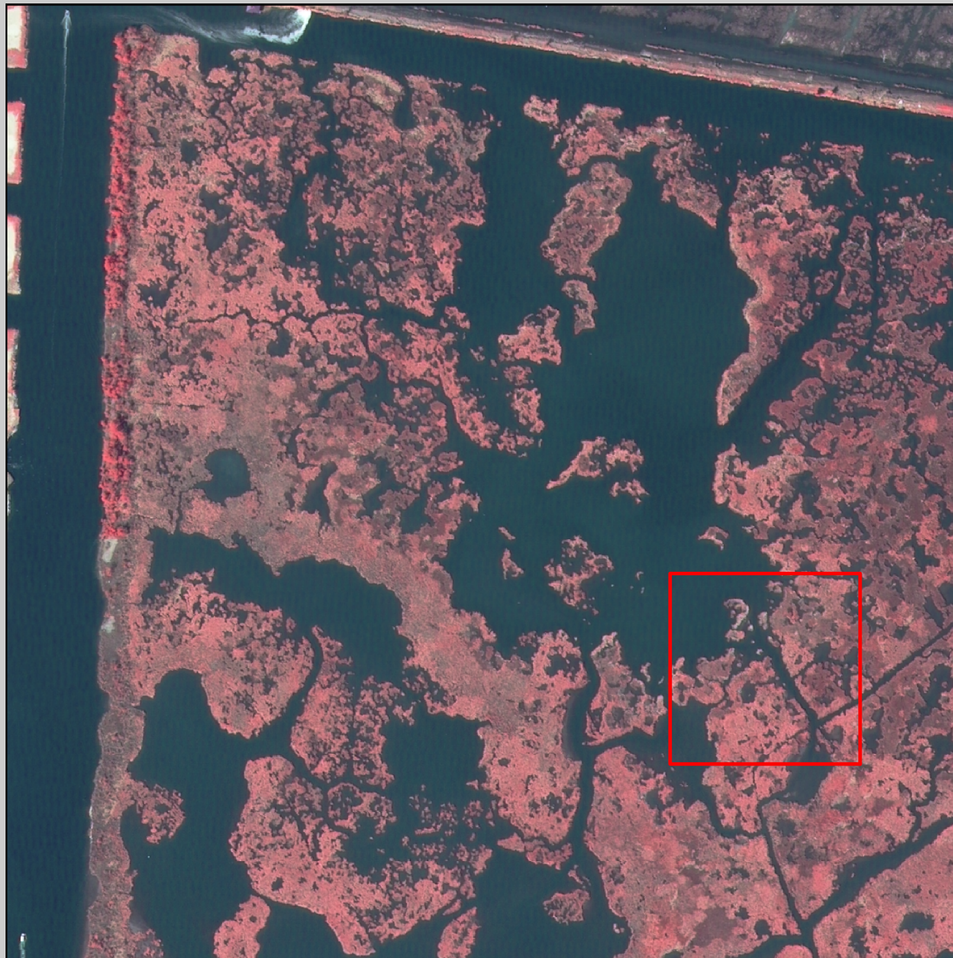
2005 Digital Image