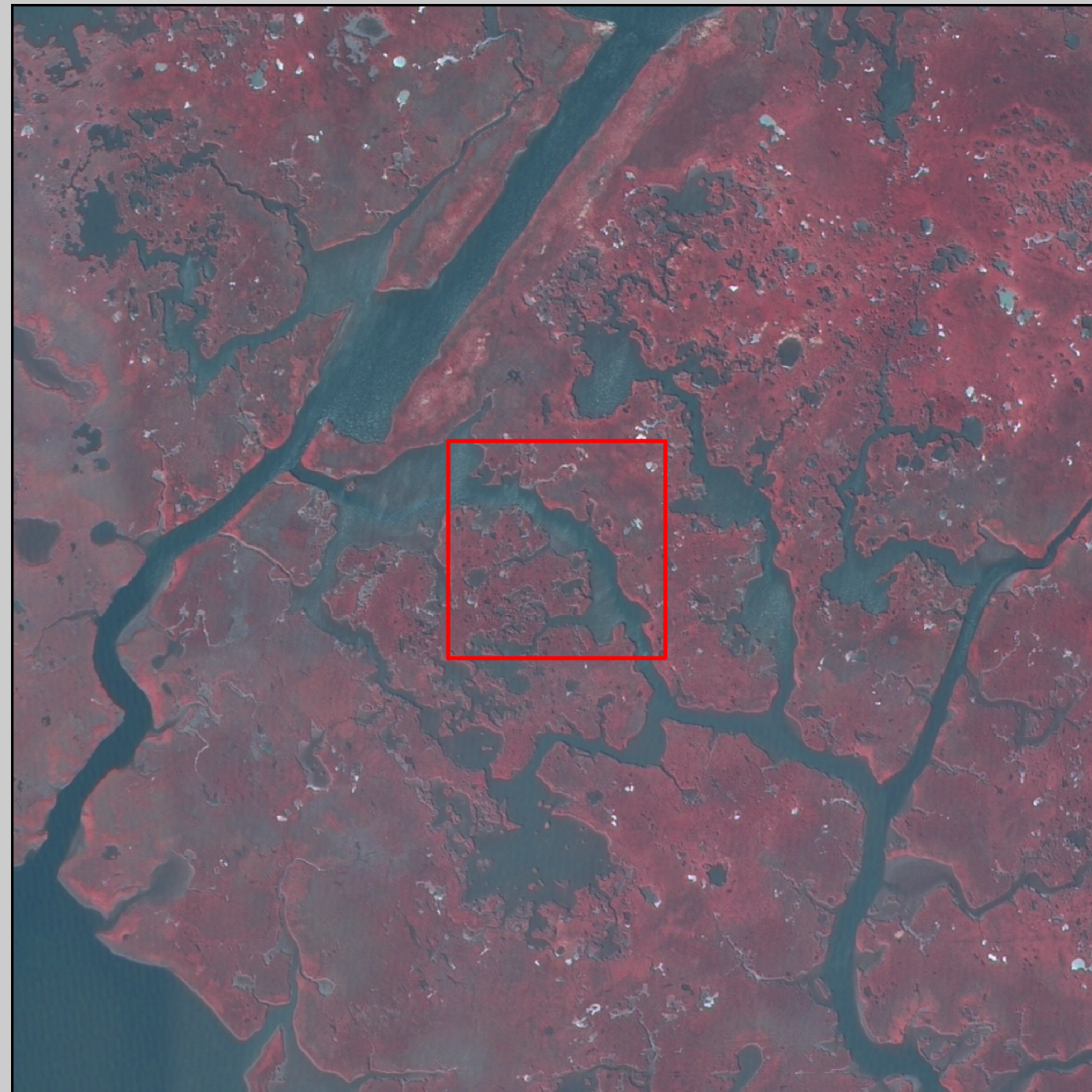
2005 Digital Image