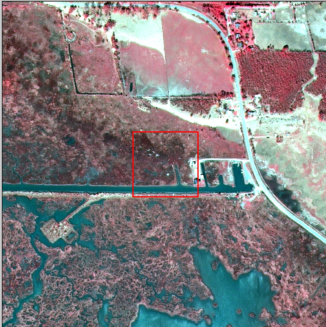
2005 Digital Image