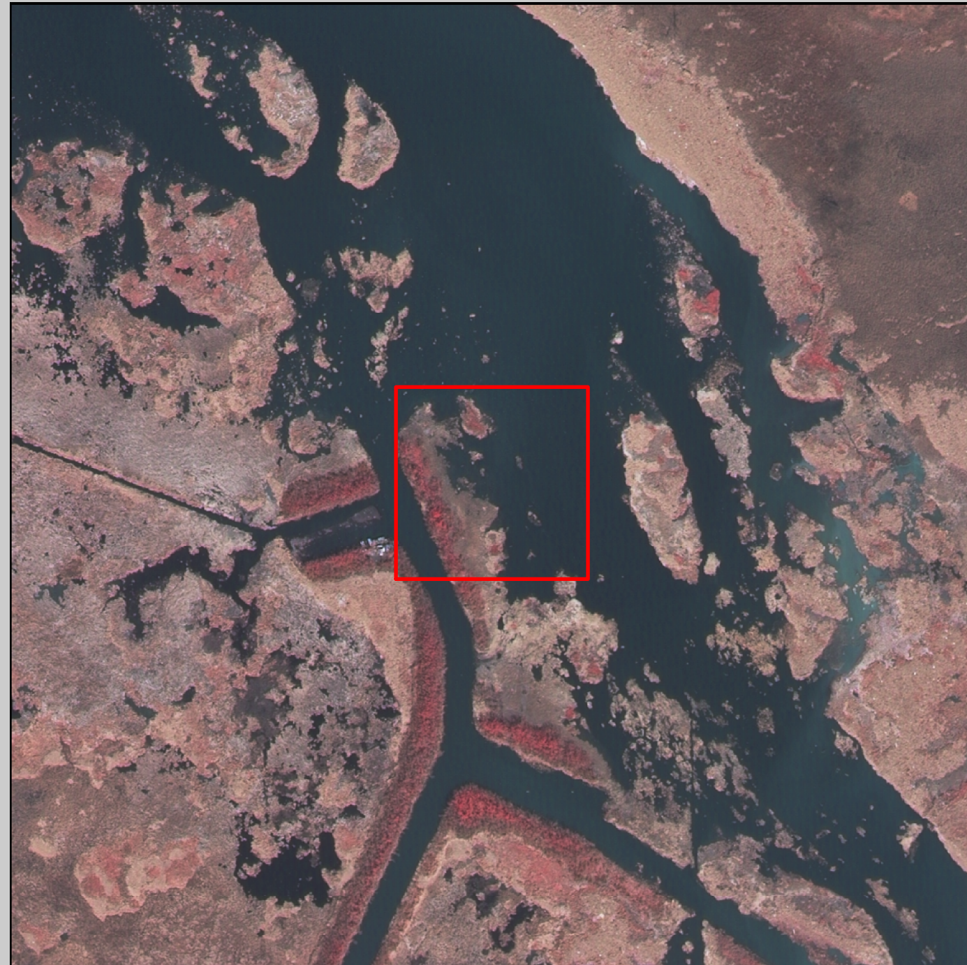
2005 Digital Image