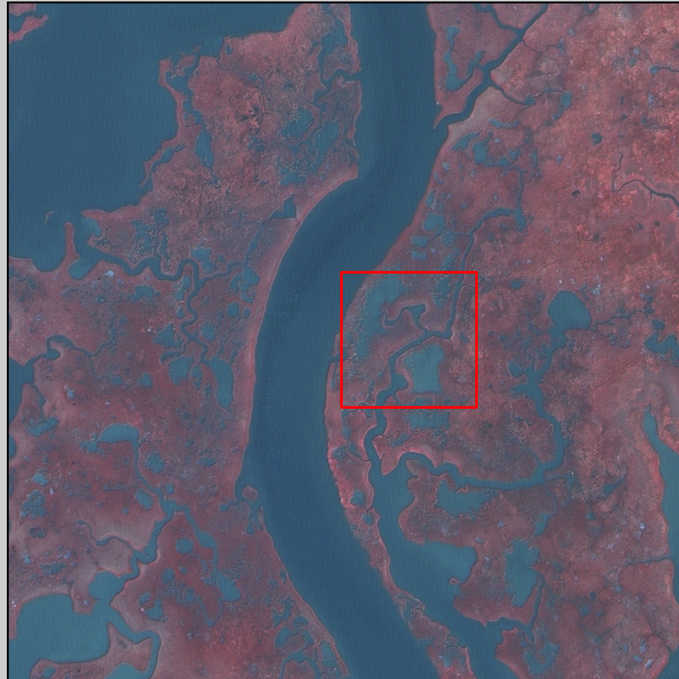
2005 Land-Water Analysis