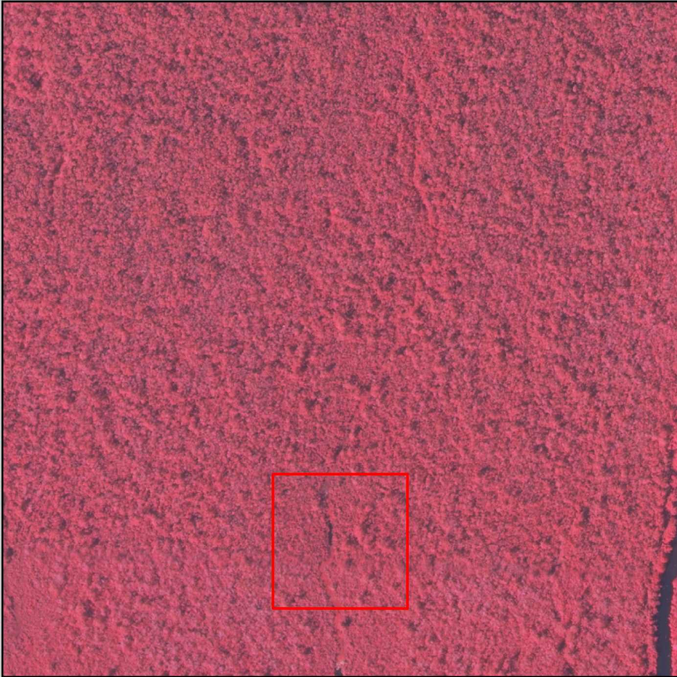
2005 Land-Water Analysis