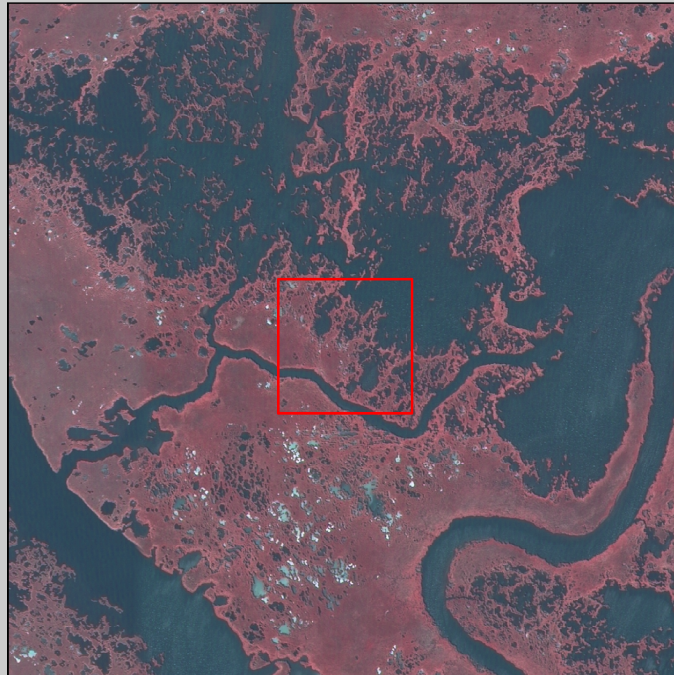
2005 Land-Water Analysis