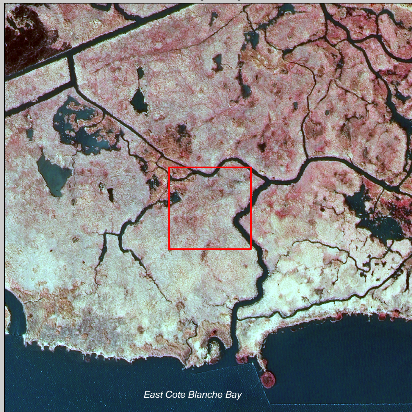
East Cote Blanche Bay