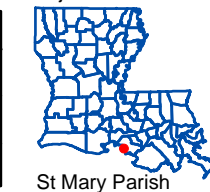
St Mary Parish