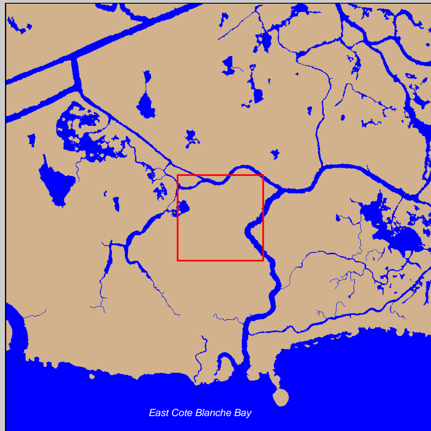
East Cote Blanche Bay

Prepared by: U.S. Department of the Interior U.S. Geological Survey National Wetlands Research Center Lafayette, Louisiana Prepared for: Louisiana Department of Natural Resources Coastal Restoration Division Lafayette Field Office