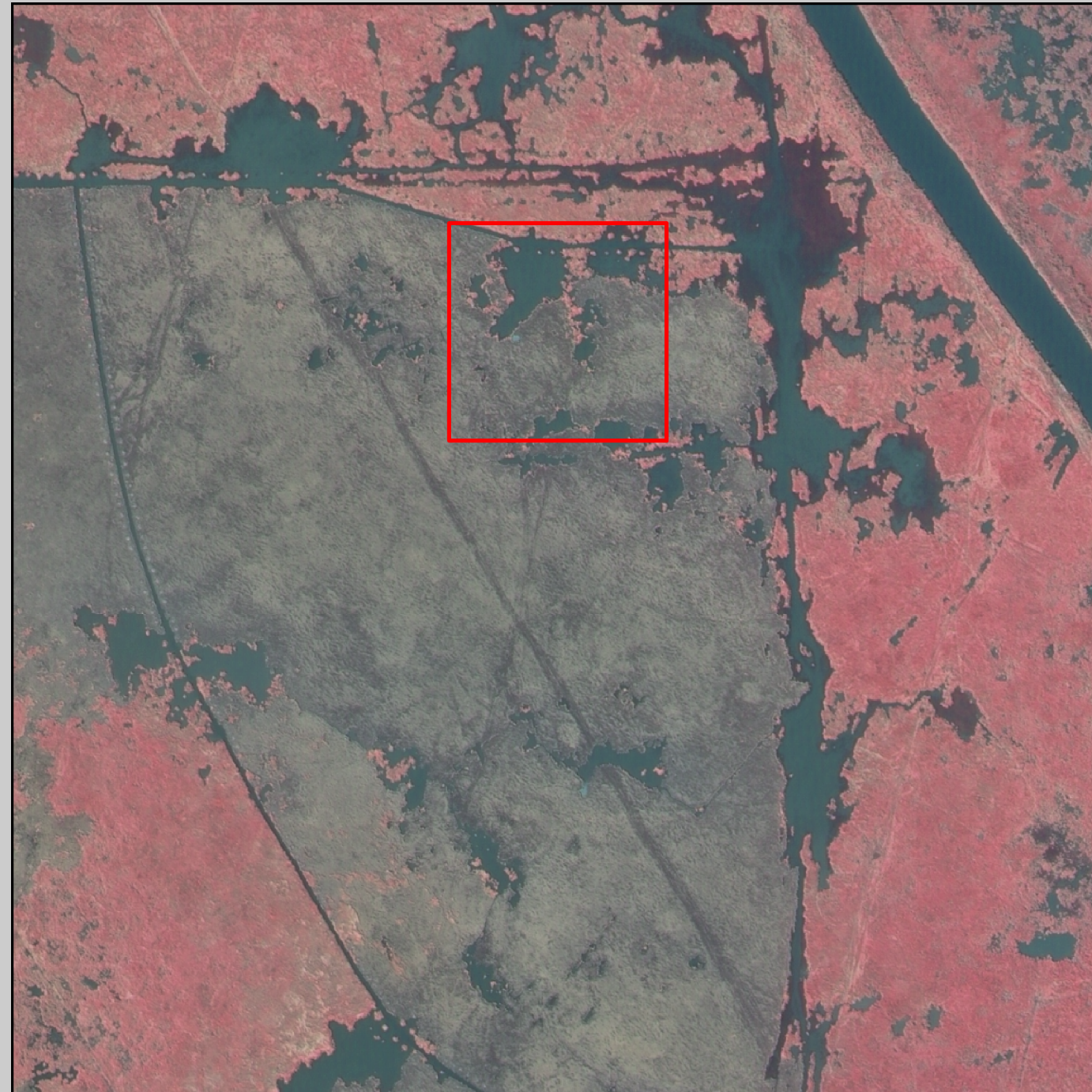
2005 Land-Water Analysis