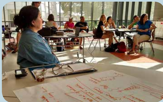
Educators listen attentively at the Waters to the Sea - Mississippi River Delta Educational Initiative in St. Bernard, Louisiana.

These elementary, middle, and high school teachers explored STEM disciplines through experimental, inquiry-based investigations at local watersheds. They increased their knowledge of the Mississippi River as a whole system, gained skills to help students enhance their STEM-focused investigation skills and discussed ways to guide the development of meaningful, engaging classroom investigation. Teachers also had time to share ideas and learn from each other. After the workshop educators are better equipped to teach students to think like a scientist, design like an engineer, and write like an author.