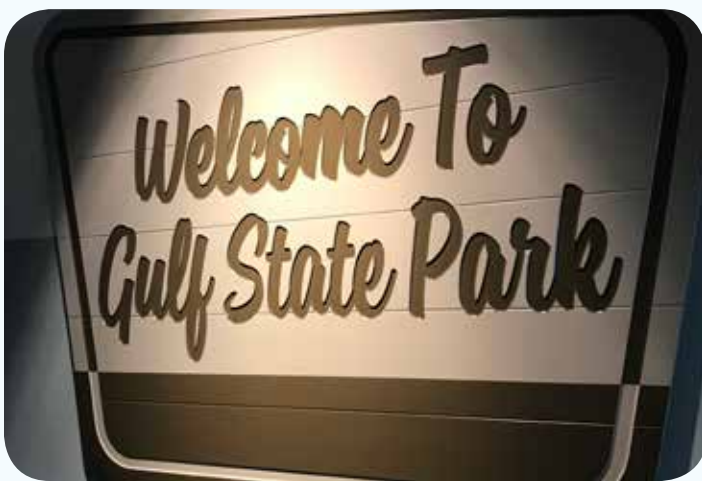
The Lodge at Gulf State Park hosted the Gulf of Mexico Alliance All Hands Meeting on June 10-13.

The Education & Engagement Team also highlighted GOMA's Embrace the Gulf 2020 campaign. 2020 is the ten-year anniversary of the BP Deepwater Horizon Oil Spill and the fifteen-year anniversary of Hurricane Katrina, and GOMA plans to highlight the many benefits the gulf ecosystems bring to the communities that live along the coast. While these disasters have made us stronger, they do not define our communities. During Embrace the Gulf 2020, GOMA is planning 365 facts to share with their network to highlight the Gulf of Mexico and a blueways paddling trail along all five Gulf States. This paddling trail will give people the opportunity to get out on the water and enjoy the coastal ecosystems all along the Gulf Coast. Stay in touch, CWPPRA will share the paddle trail details and the 365 facts to encourage you to Embrace the Gulf in 2020!