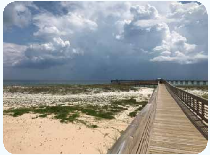
Looking out onto a dune restoration site along the Gulf of Mexico in Gulf Shores, Alabama at the GOMA All Hands Meeting.

Because CWPPRA shares the value of wetlands and engages the public in the importance of coastal restoration, we attended the Education & Engagement priority team meeting. At the meeting, individuals shared new ideas and projects to enhance the Gulf Coast. Team members from the Texas Aquarium shared their work engaging teachers to improve coastal curriculum in schools through NOAA's Watershed Environmental Education Grants. Representatives from Galveston Bay Keeper presented their project to change the behavior of individuals who toss their fishing line into the bay.