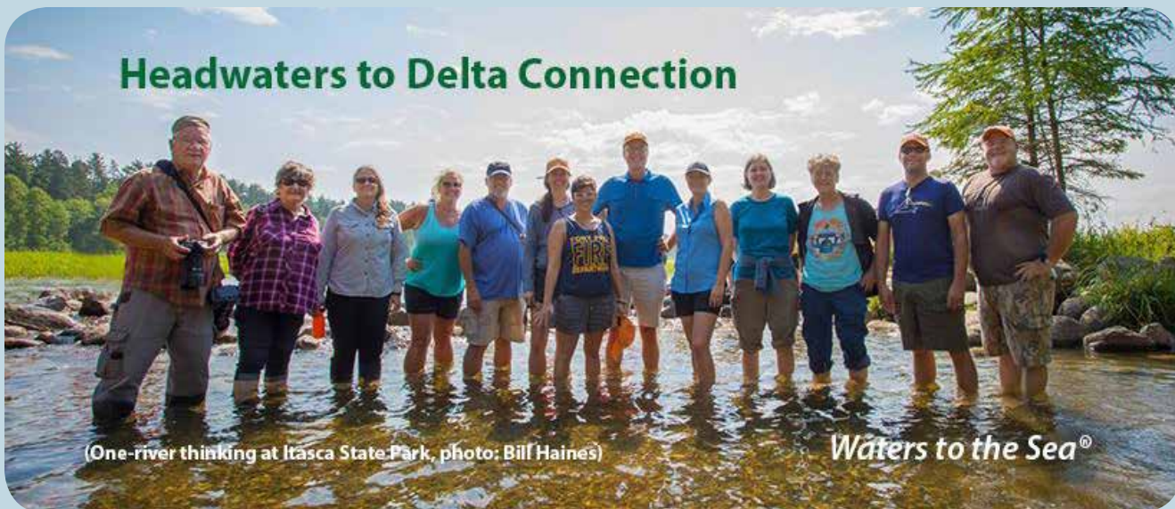
Participants at the Waters to the Sea - Mississippi River Delta Educational Initiative.

Educators also explored Bayou Sauvage National Wildlife Refuge in kayaks, saw the vastness of the Lake Borgne Surge Barrier, and chatted with various organizations working towards a healthy and sustainable river system. We are excited for the educators to take their experience in coastal Louisiana into the classroom and cultivate more wetland advocates!