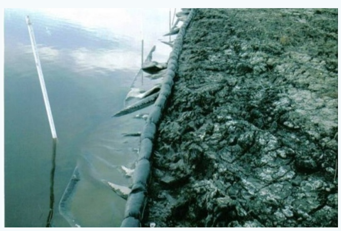
Sediment Containment System for Marsh Creation Demo (LA-09)

The CWPPRA demonstration program provides an opportunity to investigate new technologies to do exactly this. Each year as part of the project selection process, demonstration projects are nominated on the basis of new technology meeting the following three criteria: (1) it has not been fully developed for routine application, (2) the results are transferable, and (3) the technology is not duplicative. Although demonstration projects are not selected every year, many have been funded. Thoroughly studied to gauge their ability to advance wetland restoration, demonstration projects have tested a variety of new approaches to restoration in hopes of enhancing known techniques and improving performance. These projects have included testing new materials for shoreline protection that may be more suitable forLouisiana's soft soils and testing new ways of dredging and containing sediment used in marsh creation projects. Other projects have involved new approaches to vegetative plantings and techniques for regenerating delicate floating marshes. If a project shows promise, it may be scaled into a larger project that is further studied for applicability coastwide. The success of the demonstration program as a whole is found in members of the public who have been able to introduce their inventions and concepts and in agencies who have