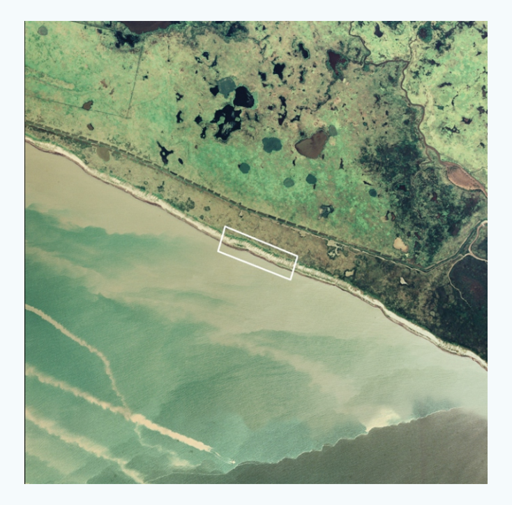
Bio-Engineering Oyster Reef Demonstration (LA-08).

Like most ecosystems, coastal Louisiana is a dynamic environment. Responding to impacts caused by both natural and engineered elements, Louisiana's coastal wetlands either adapt to or are swept away by larger forces. Restoration solutions must adapt to changing conditions or risk becoming useless. Over the course of 20 years, the CWPPRA program has had to adapt to