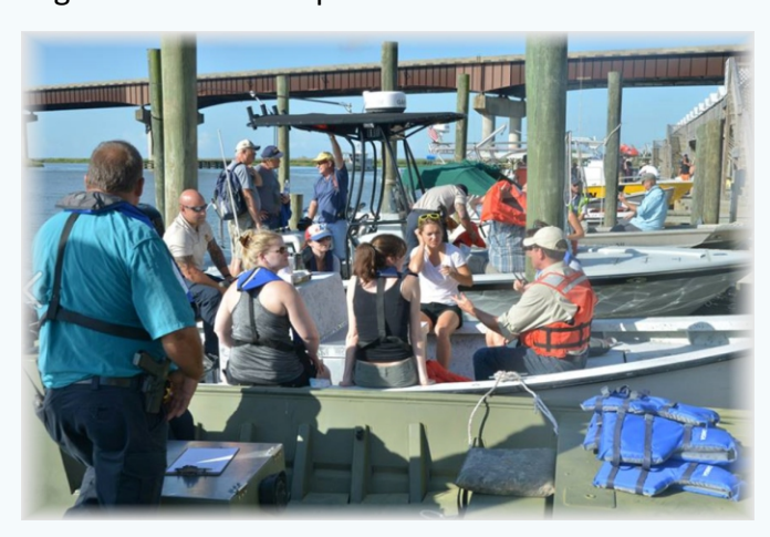
Reporters prepare for a day in the field.

The morning tour departed from Empire, LA to the barrier shoreline of Pelican Island. Reporters visited the Barataria Barrier Island Complex Project: Pelican Island to Pass La Mer to Chaland Pass Restoration (BA-38). The Pelican Island project's construction phase was completed in 2012. Reporters arrived on the back side of the island and noticed that the plant community has naturally vegetated the marsh platform.