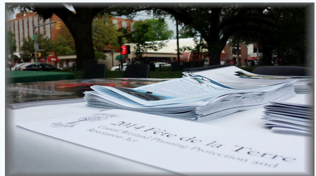
The CWPPRA Public Outreach Committee produces a variety of materials to educate students, faculty, and staff about CWPPRA's coastal restoration effort.

partnership with the University's Environmental Science Department.