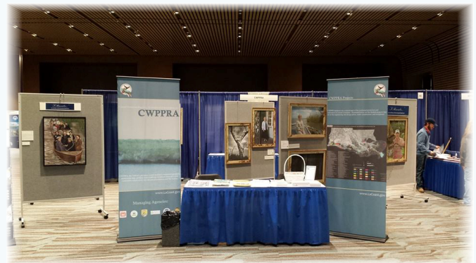
The CWPPRA Outreach Booth along with the "I Remember..." Oral History art display, at the 2014 State of the Coast Conference.

The Coalition to Restore Coastal Louisiana held its bi-annual State of the Coast Conference in March at the Morial Convention (Continues on Page 3)