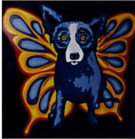
George Rodrigue