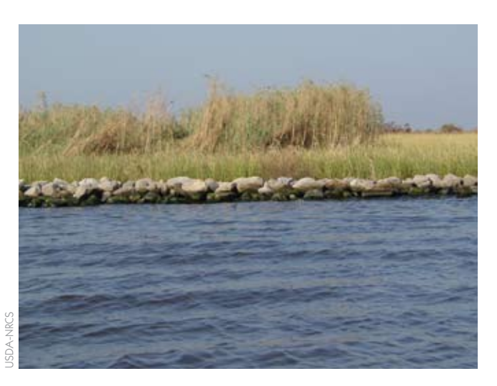
A mature, self-sustaining marsh flourishes behind a rock barrier. Such barriers will encourage the stabilization of Lake Boudreaux project areas by protecting them from wave-induced erosion.