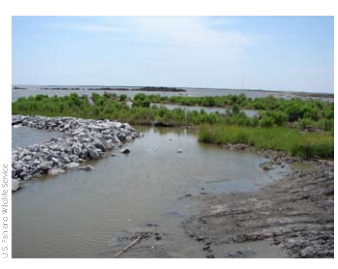
As vegetation emerges, newly created marsh begins to function as a wetland ecosystem. Roots stabilize the soil and decaying plant material adds organic bulk to the system and feeds myriad organisms that comprise essential links in the wetland food chain.

the lake's shoreline westward, threatening to dissolve the marshes and engulf the lagoon lying between