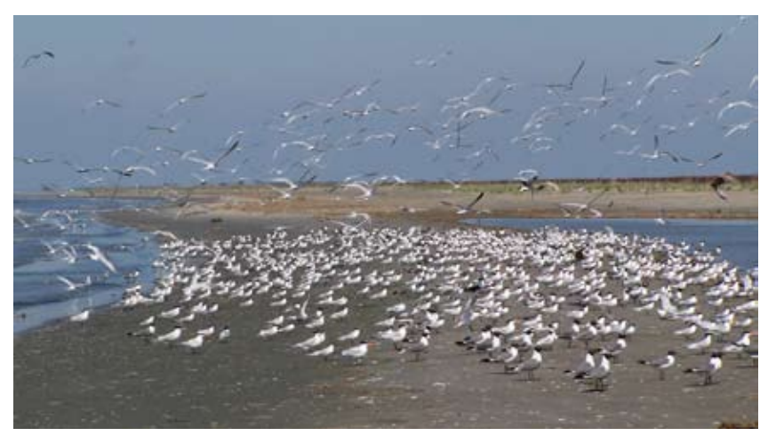
Habitat, bounty and beauty — a restored barrier island is not merely a bulwark against hurricanes. Nurturing marine fisheries, providing food and shelter to coastal birds and wildlife, offering a destination to fishermen and eco-tourists, barrier islands are intrinsic to the environmental and cultural life of southern Louisiana.

Part of the Barataria Barrier Island Complex Project: Pelican Island and Pass La Mer to Chaland Pass Restoration (BA-38), work at Chaland Headland increased the island's width and average height using materials dredged from a site in the Gulf of Mexico. Sand fencing and vegetative plantings further enhanced and protected the island's dune, swale and