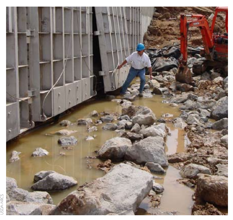
Shown during construction, the gated culverts built under Louisiana Highway 384 restore historic drainage through Black Bayou into Lake Calcasieu. However, the project also provides managers with the option to respond to drought by pinning the gates shut and retaining water in the interior marshes.

Historically Black Bayou provided westerly drainage