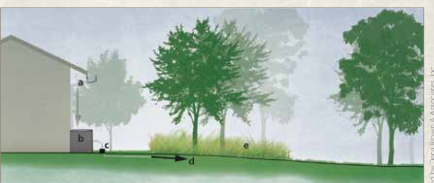
a rain gutter system b cistern c irrigation pump main line d flows outward to the rest of the irrigation system e lawn/vegetation

Green infrastructure has the added advantage of enhancing the quality of urban life, transforming unsightly hard infrastructure into attractive landscape elements. "We are designing and building playgrounds with subsurface detention basins," says Duhe. "Under normal conditions the area is dry, providing a field for kids to play on, but in extreme rain events it collects water and holds it temporarily. When the drainage system is able to accommodate the volume, the stormwater is slowly released." Duhe cites another example, a retention