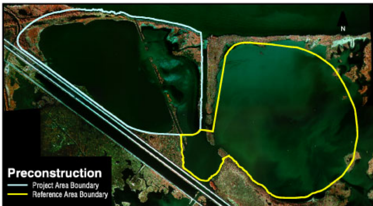
1:12,000 scale aerial photography taken November 7, 1993, shown here at 1:23,000 scale.