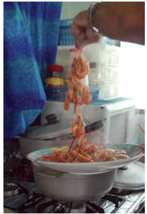
LSU Sea Grant College Program