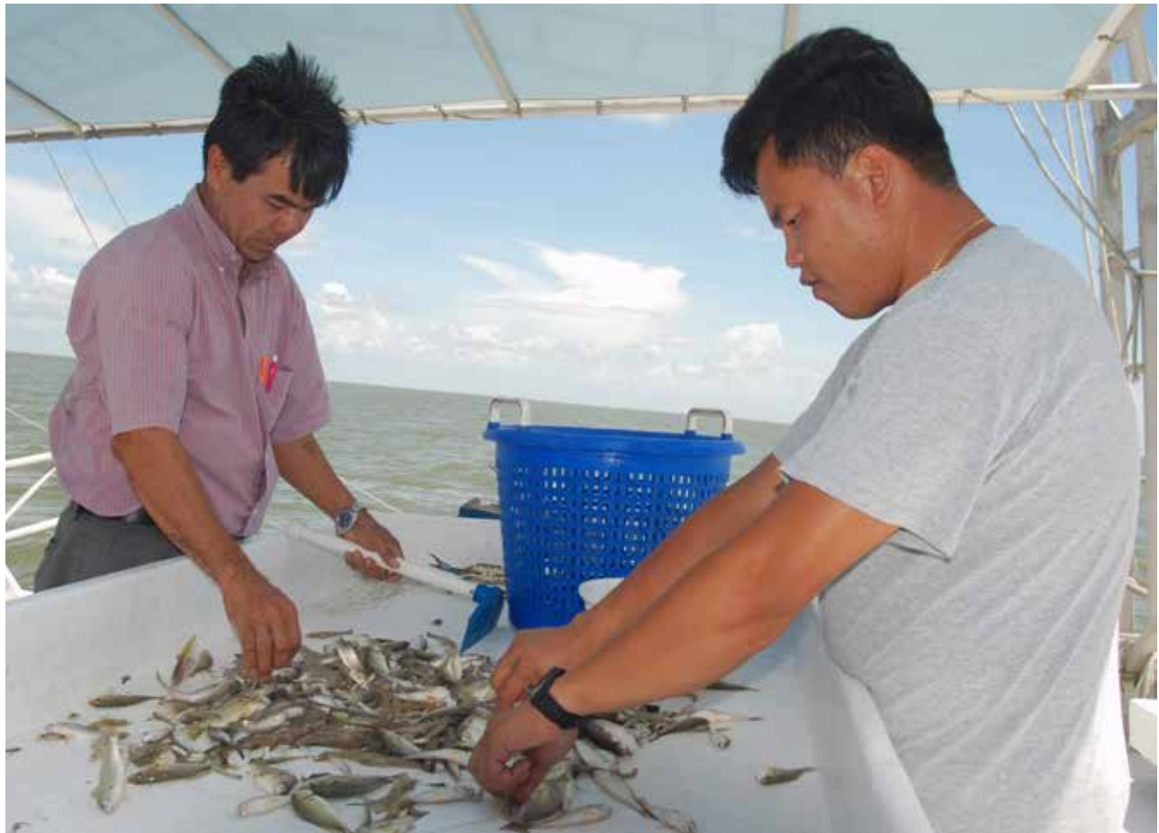
LSU Sea Grant College Program