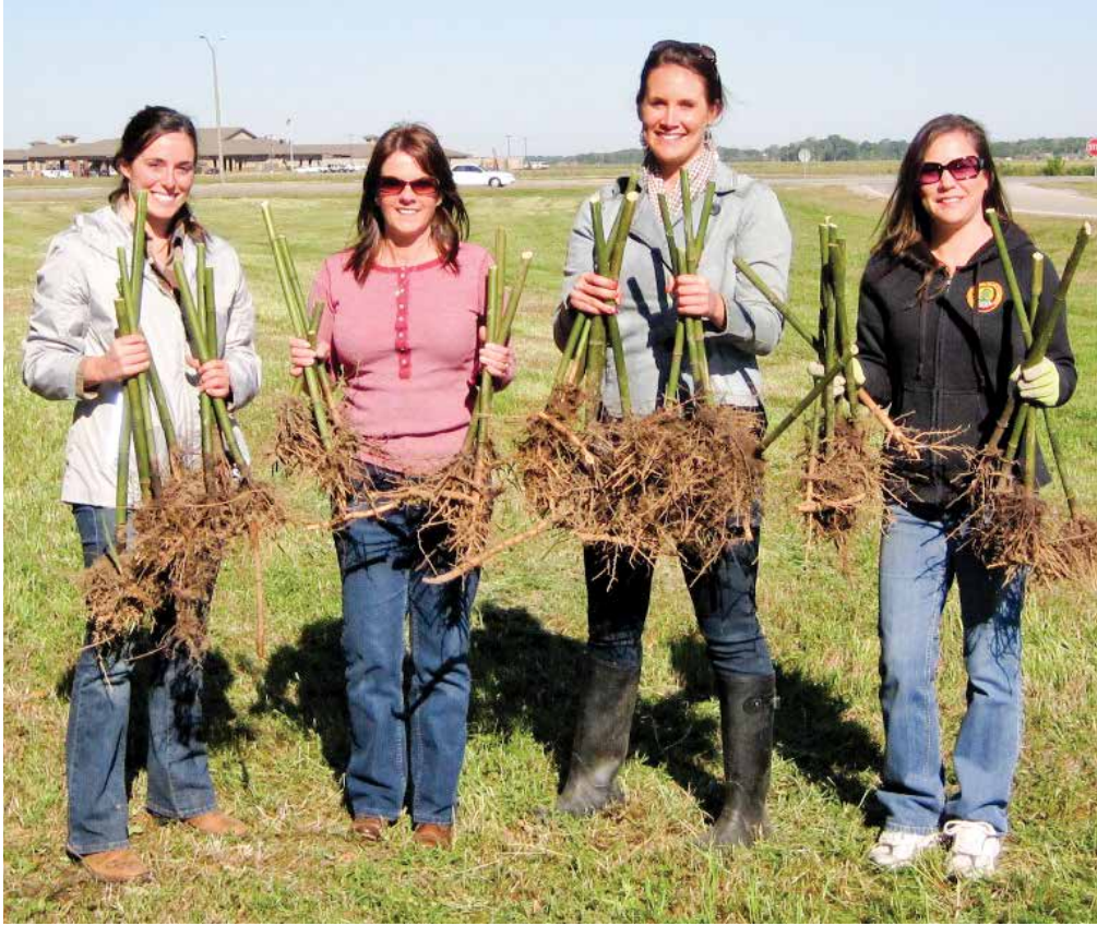
Cultivating the river cane used in Chitimacha basketry maintains this cultural facet of the tribe. Since 2001 the USDA Natural Resources Conservation Service has worked with the tribe through a consultative process to propagate and establish on tribal land the varieties of river cane traditionally used by Chitimacha basket weavers.

Sediment Diversion (MR-03) and Bohemia Mississippi River Reintroduction (BS-15). “Some fishermen object to diversions’ effects on shrimp and oysters. But if there is no fresh water coming into the marshes, they just erode and vanish more quickly,” says Verdin.